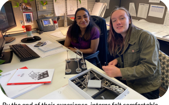
By the end of their experience, interns felt comfortable talking about AutoCAD, SketchUp, prototype, surveying, fieldwork, girders, soundproof chambers, 3D modeling, and more!