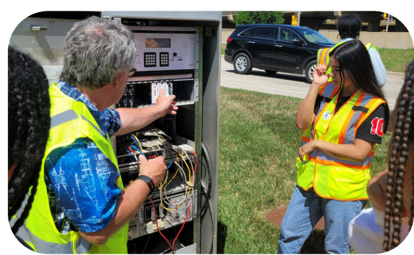
Trips to the field showed interns the real applications of careers they learned about in the office and their impact on our community.